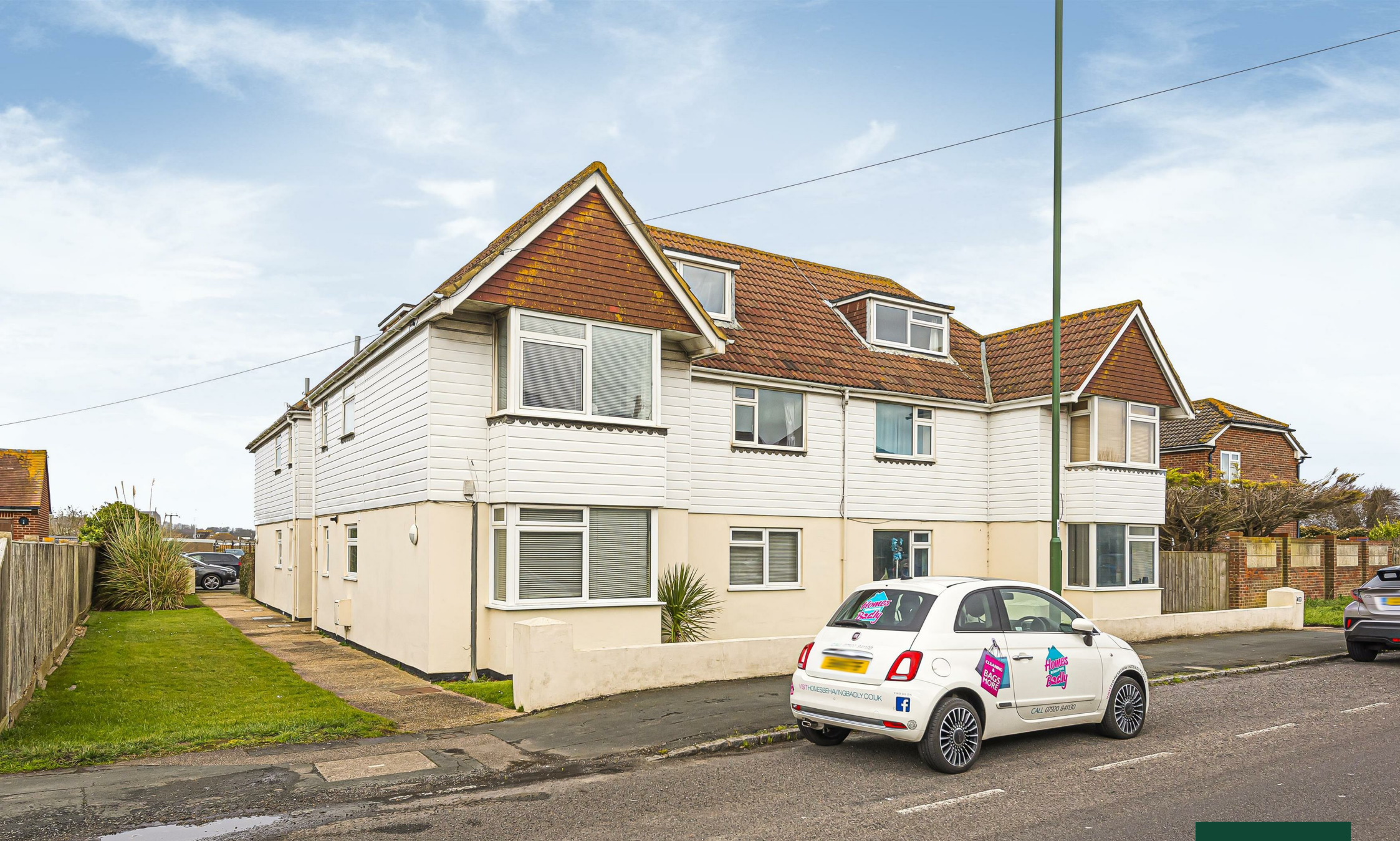
Flat 5 Adur Court Brighton Road | | Lancing | BN15 8LF